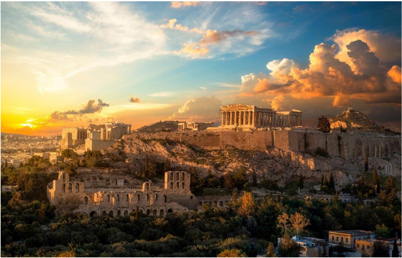
View of the Acropolis

Athens: Acropolis, Philopappos Hill, Pnyx, Socrates prison, Acropolis Museum, Anafiotika, Plaka, Roman Agora (Breakfast included)