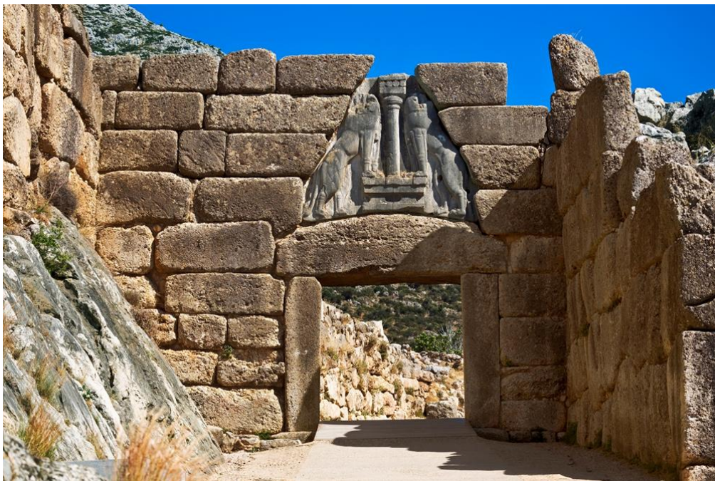
Lion's gate at Mycenae