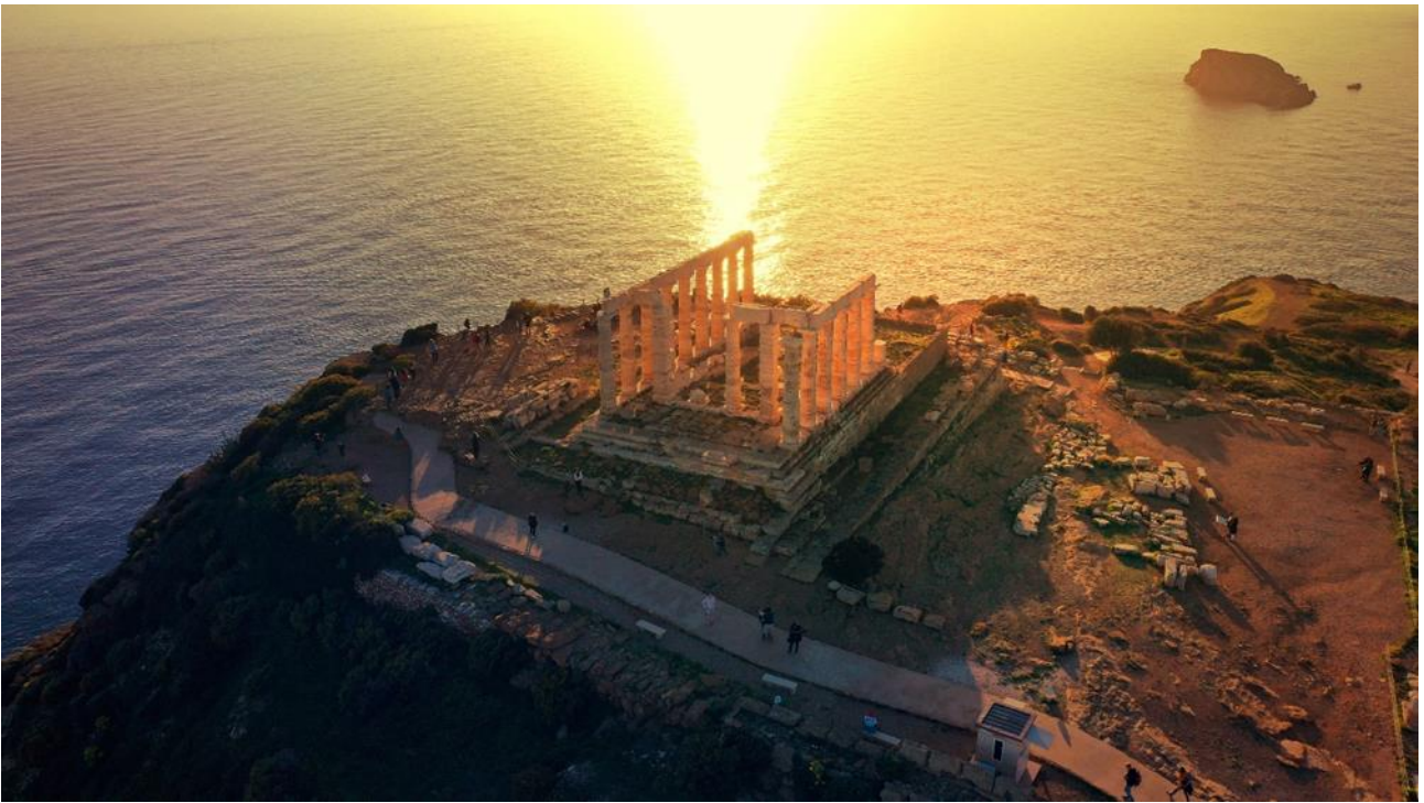
View from Temple of Poseidon at Sounion

We get back on the bus and drive to Sounion (10 minutes) to the magnificent Temple of Poseidon, crowning the cliff overlooking the Aegean Sea. Legend tells that it was here that King Aegias of ancient Athens committed suicide by jumping from the cliff – giving the Aegean Sea its name. There is also a Temple of Athena on this site. The Temple of Poseidon is one of the most beautiful sights in the world.