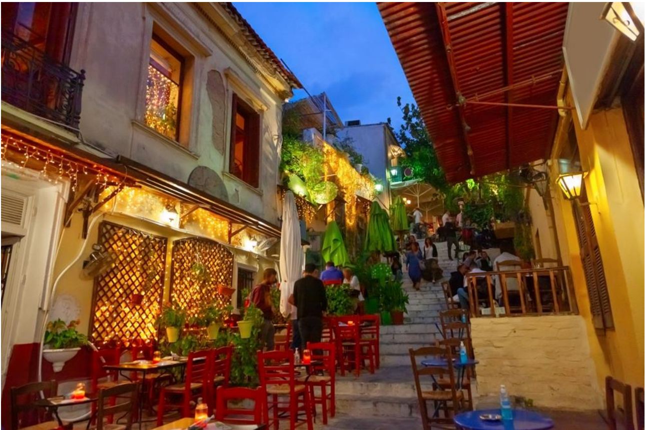
Restaurants in Plaka

After the museum we go to Anafiotika – a quaint little village on the slopes of the Acropolis, resembling a Greek island, where we have lunch at any one of the little restaurants lining the alleys (at your own cost). After lunch we wander through the Plaka to the Roman Agora, with Hadrian’s Library, the Horologion of Kyrrethos /Tower of the Winds, and the Vespasianae or public ancient toilets. The rest of the afternoon is free for wandering around the shops and flea markets of the Plaka and dinner at your own cost. Return to the hotel.