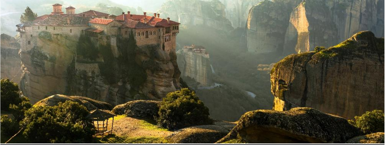
Cliff monasteries at Meteora