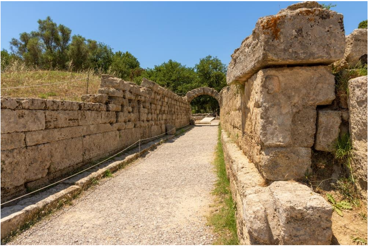
Entrance to the Stadion at Olympia