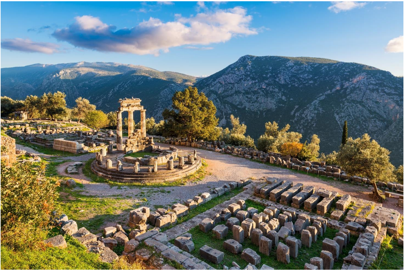
Tholos at Delphi