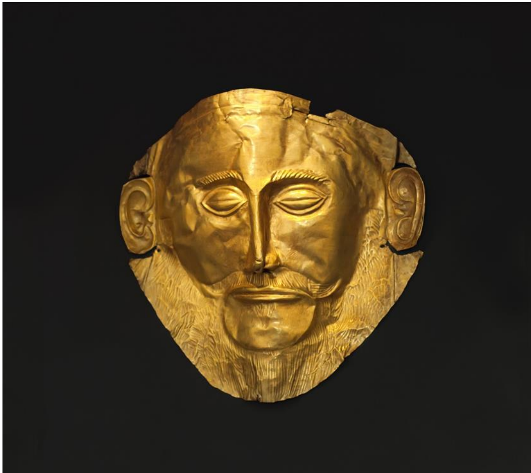
Famous Death Mask of Agamemnon

The bus picks us up and takes us to the National Archaeological Museum. Highlights at the museum is the Golden Mask of Agamemnon, the Bronze statue of Zeus/Poseidon, the jockey from Artemision, the Antikythera device and shipwreck display. Antiquities of Thira (Santorini), and the collection of Mycenaean Antiquities covers several halls. The Death Mask of Agamemnon as well as the jockey from Artemision are included in the exchange agreement between Greece and the British Museum. So if we are lucky enough to view the missing Parthenon Marbles, we may miss out on the mask and jockey, as they would be traveling to Britain.