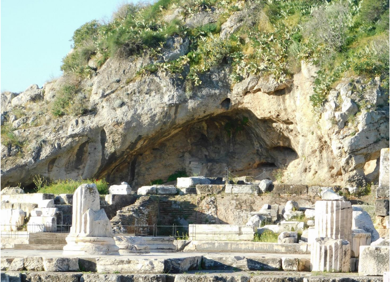
Ploutonion, entrance to Hades' underworld at Eleusis

Then we drive to Rhamnous (20 minutes) where we find the sanctuary of the goddess Nemesis – the goddess of vengeance as well as a temple of the goddess Themis, the goddess of justice. The ruins of the ancient fortified acropolis offers a stunning view of the island of Evia.